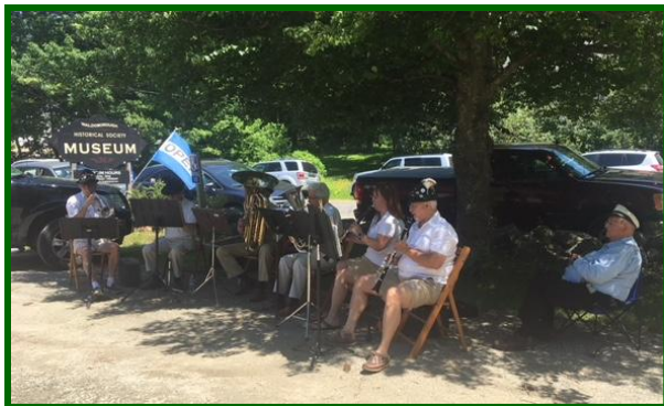
A terrific Waldoborough Historical Society 50 th Anniversary Celebration took place on Sunday, June 17, 2018! Over sixty people gathered to listen to the Kora Shrine German Band playing German musical numbers.